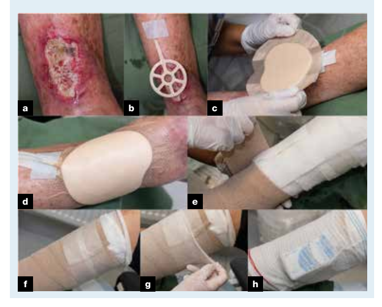
Fig 1. Application of topical continuous oxygen treatment (TCOT) device. The oxygen delivery exhaust is placed directly on the wound and fastened with an adhesive bandage followed by standard compression bandaging. The battery and oxygen electrolysis units are worn outside the bandaging and connected to the exhaust via a tube. Leg ulcer (a); cannula with oxygen efflux (b); adhesive bandage (c); after adhesive bandage placement (d); standard compression bandage placement (f); TCOT device holder (g); TCOT placement (h)

diseases and side-effects of drug treatment (Table 1). The oxygen outlet from the device was placed immediately on the wound surface and covered with an adhesive Allevyn gentle border foam dressing (Smith+Nephew AB, Sweden), and compression bandaging was applied to the majority of patients (Fig 1 and Table 2). The mean age of patients was 61 years (range: 13-87 years) and included 14 (70%) male patients and six (30%) female patients. The mean duration of follow-up while treating TCOT with was 3 months 21 days (range: <1-12 months). For wounds that completely healed, the mean duration for follow-up was 5 months 5 days (range: 1–12 months), and for incomplete wound healing, the follow-up period was 2 months 26 days (range: 1-6 months). Follow-up time for ulcers that healed was on average higher than for wounds that did not heal, primarily because wounds that did not exhibit any healing tendency at all stopped TCOT early.